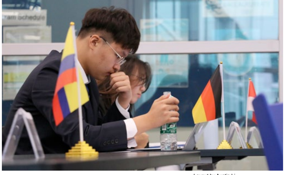
Photographs by All Photographers