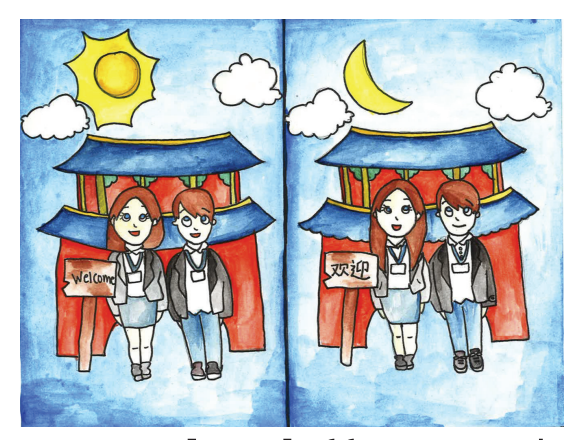
Spot the differences!