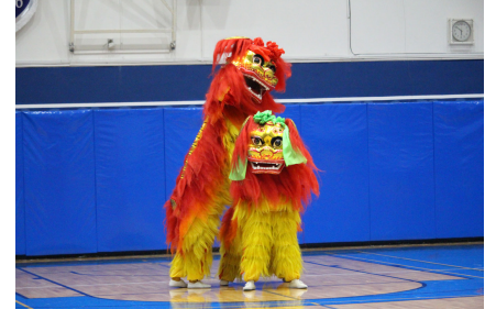
Lion dancers performing the Chinese traditional lion dance during the cultural ceremony

To conclude the opening ceremony, a team of professional acrobats performed for the 400 delegates. From the hat juggling human pyramid to bowl acrobatics, the acrobats had the delegates on the edge of their seats, giving the delegates insight into the wonders of Chinese culture.